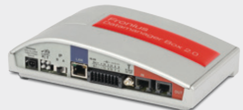
/ Fronius Datamanager Box 2.0